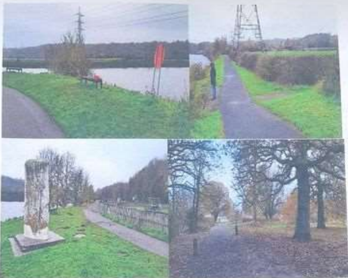
Tyne Riverside Country Park Newburn.

The North Side Boundary going west from the slip way. Starts from the white standing stone and continues till you come the two bollards in the path.